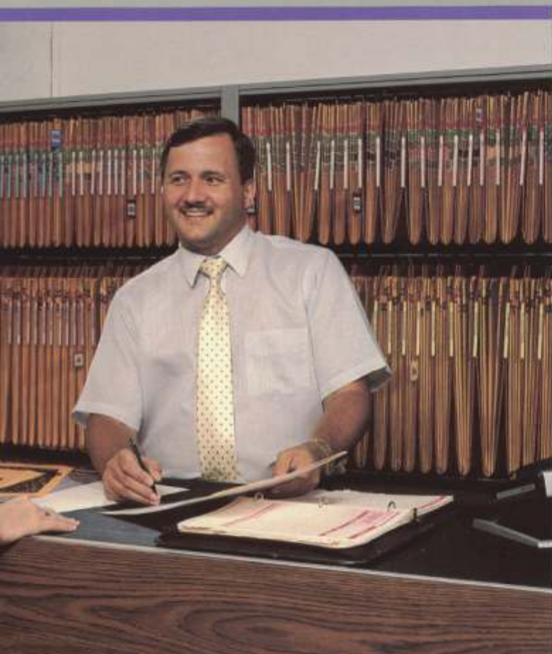
...s and in-house printers.