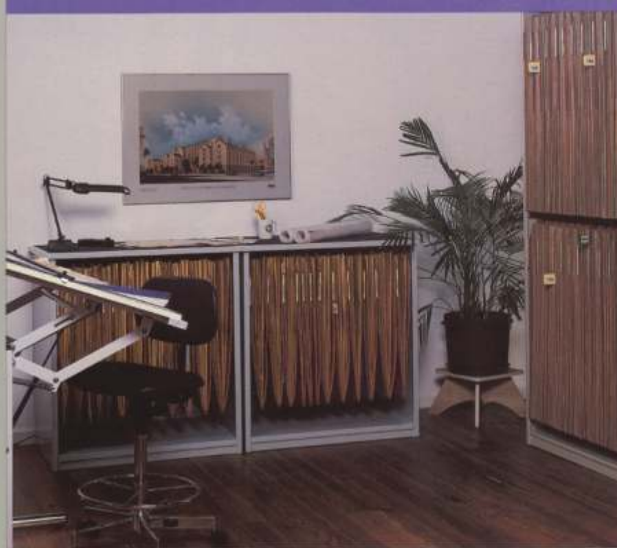
Your work environment is totally organized with ARTSTOR.