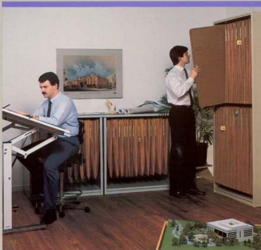
Safestor is the perfect filing solution for architects and engineers.