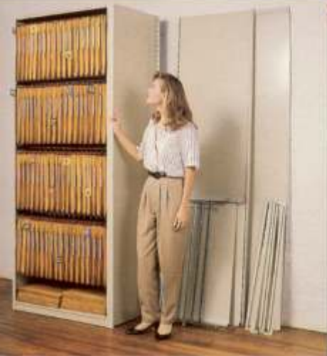
r systems are easy to expand.