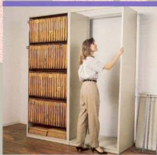
Snap in add-on upright...