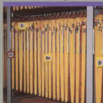
Color-Keyed Indexing™ makes locating your work a snap!