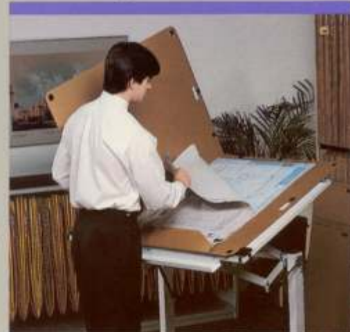
Safestor portfolios keep valuable drawings protected and organized.