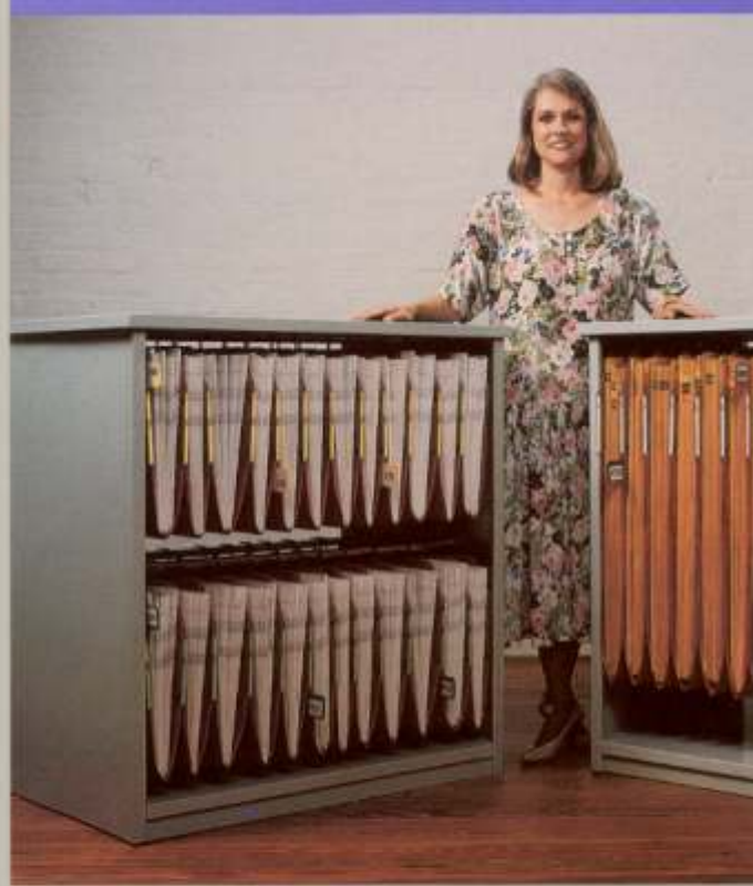
Artstor 40 units accommodate two standard material sizes.