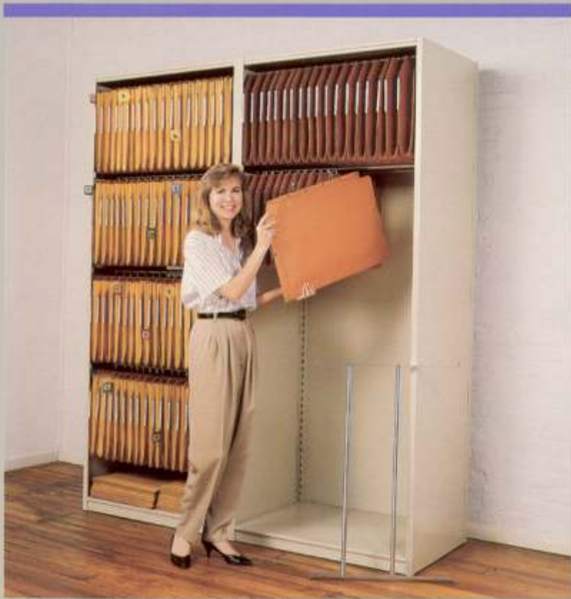
and you're ready to load your ARTSTOR system.