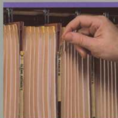
Easy-to-read laser-printed labels are simple to insert and change.