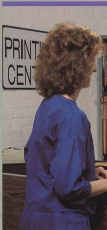
ARTSTOR is the top filing system for printshops.

From franchised quick printers to in-house print shops to large book and newspaper publishers, ARTSTOR has led the way in innovative designs for the storage and retrieval of valuable printing materials.