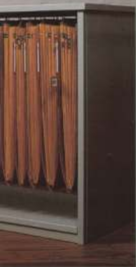
Handy work surface and efficient filing system in one compact unit.