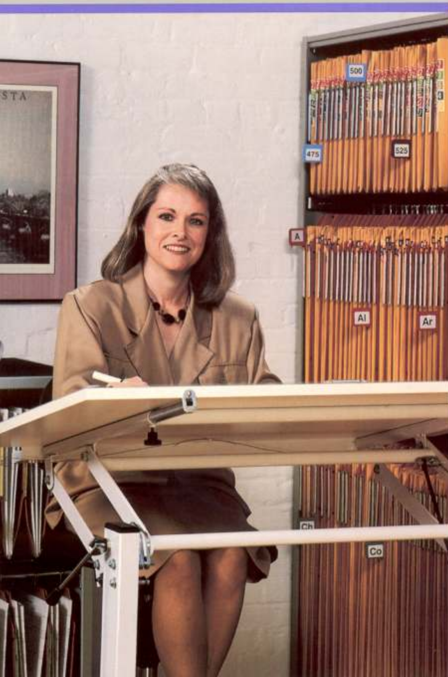
Graphic artists and designers get organized with ARTSTOR.

identifies inactive jobs, making purging a snap.