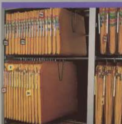
Sidestops keep flimsy materials upright.